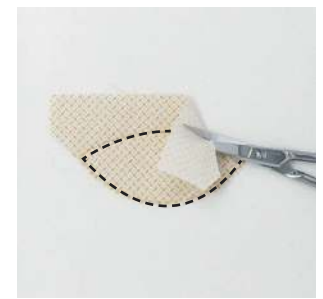
D. Trim fabric close to the stitch line.

Note: If you are using a pre-cut piece of fabric, skip step C and D.