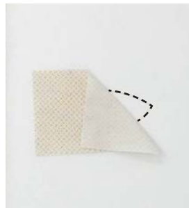
B. Place Fabric 1 right side up , covering the placement line.